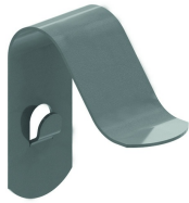
Cover clamp clips DCL