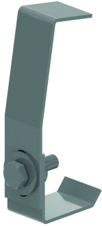
Cover clamp for HDKLIE DKI