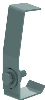
Cover clamp for HDKLIE DKI