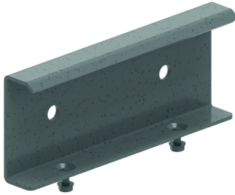
Joiner for HDKLIE HDLVIE