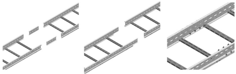
Toothed round head bolt / flange nut VM