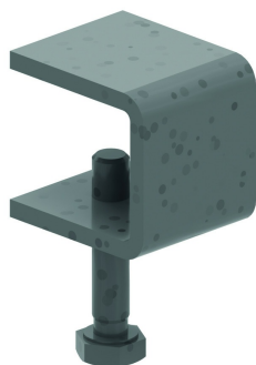
Cover clamp ZMDKIG