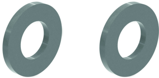
Giant washer (DIN 125-1 A) RO