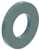
Giant washer (DIN 125-1 A) I6RO