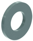
Rondelle (DIN 125-1 A) I6RO