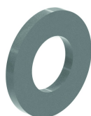
Rondelle (DIN 125-1 A) I6RO