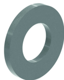
Rondelle (DIN 125-1 A) I6RO